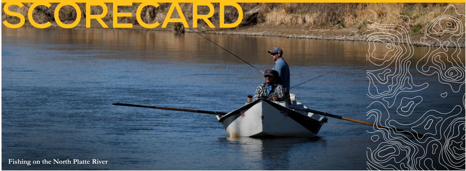
Fishing on the North Platte River