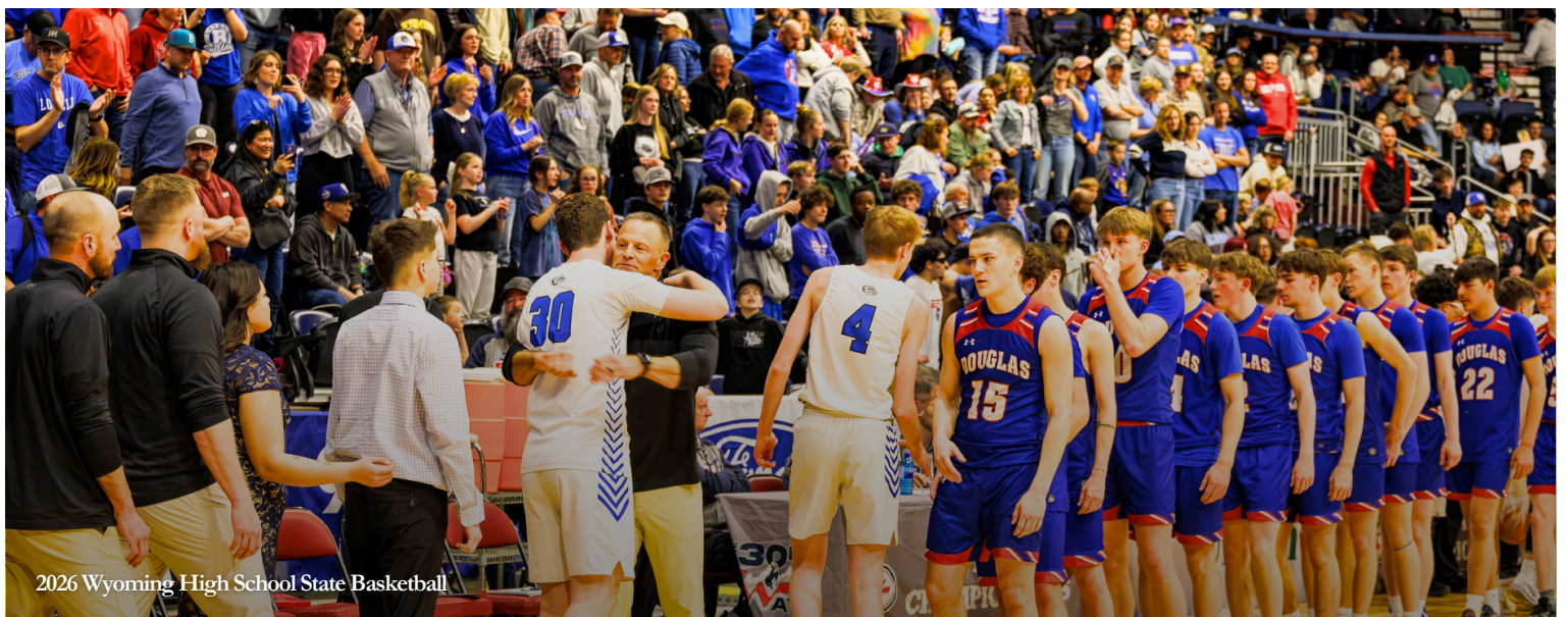
2026 Wyoming High School State Basketball